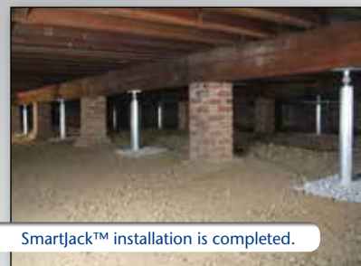
SmartJack™ installation is completed.