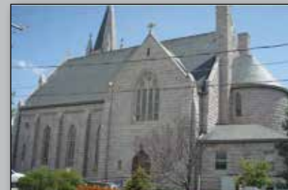
Sacred Heart Church, a historical landmark.