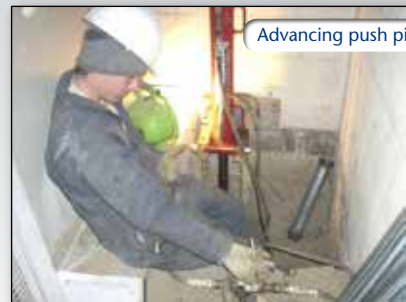
Advancing push piers