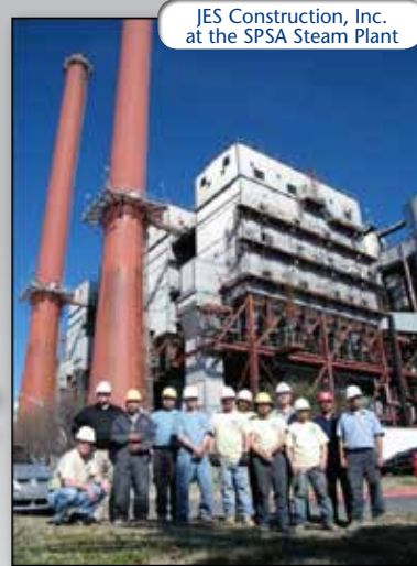
JES Construction, Inc. at the SPSA Steam Plant

Solution: JES Construction, Inc. installed twenty-nine (29) Foundation Supportworks™ Model 288 Push Piers to stabilize and lift the settled area of the building. The piers were installed on the inside of the building, so excavation was done by hand and excess material hauled out in wheel barrows. The geotechnical investigation identified suitable bearing soils at a depth of about 60 feet. However, the subsurface conditions varied significantly, and pier depths ranged throughout the building from about 50 feet to over 100 feet. The settled area of the administration building was stabilized and then lifted 1 ½ inches back toward its original elevation.