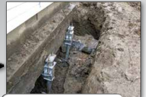
Helical piers installed; foundation stabilized and leveled prior to backfilling.