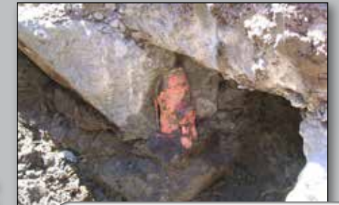
Removal of failed bottle jacks and large concrete footing put in place by the first repair contractor.

Solution: J&D Basement Systems replaced the ineffective concrete footings with nine (9) Foundation Supportworks™ Model 288 Helical Piers to permanently stabilize the foundation. The piers were advanced to depths of over 12 feet and to estimated, torque-correlated ultimate capacities of over 47,000 pounds. L-shaped foundation support brackets were then positioned below and against the footings and hydraulic cylinders were used to lift the foundation back toward a level position. The helical piers effectively stabilized the foundation and restored value to the home.