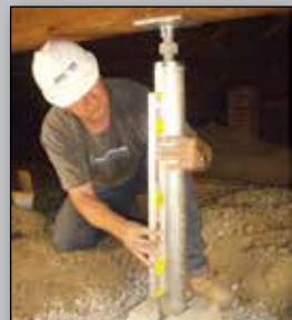
SmartJack™ is installed and plumbed.