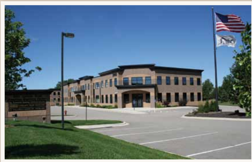
Corporate Headquarters • Burnsville, Minnesota