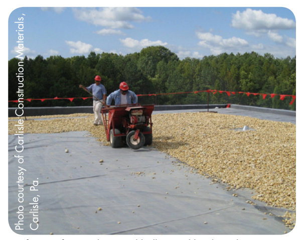
Roofing professionals spread ballast and level out the stones to ensure even coverage.

No fasteners or bonding adhesives are used in a ballasted system's field. As a result, no volatile organic compounds are emitted into the atmosphere and building occupants are not disrupted by bothersome odors. Furthermore, because no fasteners are used for a ballasted assembly, thermal bridging is not an issue. It is estimated that between 3 and 8 percent of insulation's R-value is lost when mechanical fasteners are used in a roof's field.